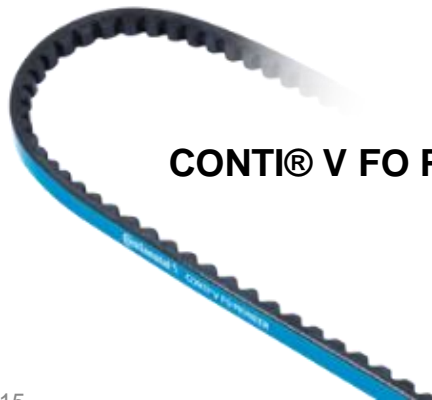
CONTI® V FO PIONEER